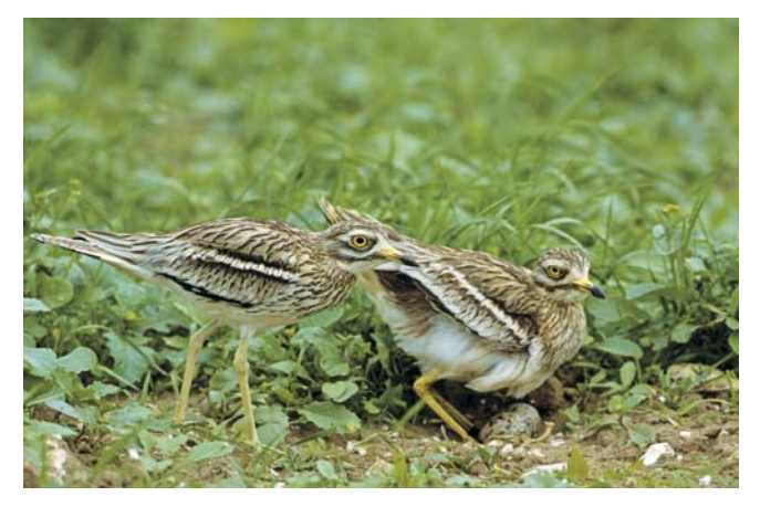
Figure 7 Stone Curlews ( Burhinus oedicnemus ) may maximise egg camouflage by choosing nest sites that optimally match their egg colours. Stone Curlews often nest in shallow scrapes in open farmland, making their eggs vulnerable to a diverse suite of mammalian and avian predators. An important goal of future research will be to incorporate specific models of predator vision to evaluate a "predator's eye-view" of egg colour and pattern camouflage.

Background matching occurs when the subject's appearance generally matches aspects of the colour, brightness, and pattern of the background (Stevens and Merilaita, 2009a). It was this form of crypsis Wallace (1889) had in mind when he described, rather poetically, the close match between shorebirds' eggs ( e.g. Figures 1 and 6) and their backgrounds: "Here are two birds which nest on sandy shores, the lesser tern and the ringed plover, and both lay sand-coloured eggs, the former spotted so as to harmonise with coarse shingle, the latter minutely speckled like fine sand, which are the kinds of ground the two birds choose respectively for their nests. The common sandpipers' eggs assimilate so closely with the tints