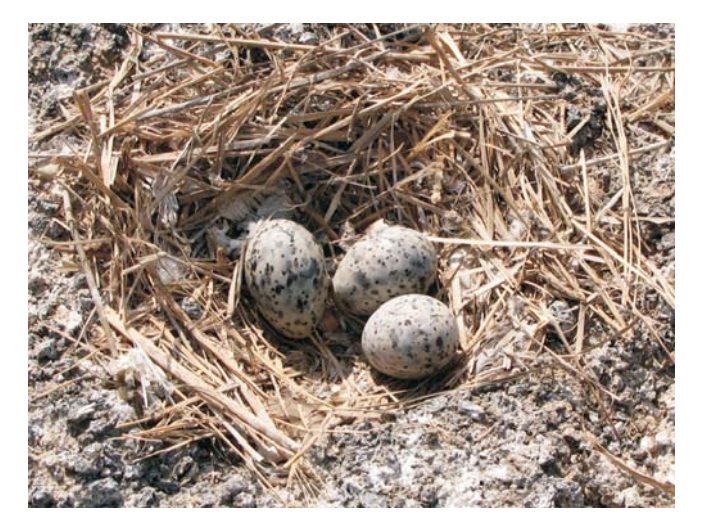
Figure 6 The colour and markings of Heermann's Gull ( Larus heermanni ) eggs on Isla Isabel, Mexico, may provide camouflage via background matching, when the egg matches aspects of the background, or via disruptive colouration, when contrasting markings help to break up the outline of the egg. It is also possible that gulls nest near objects that increase the visual complexity of the clutch in order to enhance egg camouflage (complexity crypsis).

cryptic egg appearance. For our purposes, we consider visual crypsis only and follow definitions proposed by Stevens and Merilaita (2009a).