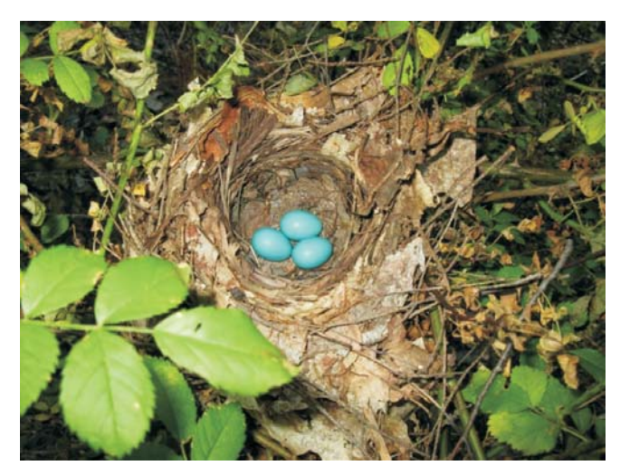
Figure 3 Vivid blue eggs laid by a Gray Catbird ( Dumetella carolinensis ). The evolution of blue eggs in diverse avian lineages remains a mystery. One hypothesis is that blue eggs may appear camouflaged in nest environments surrounded by green vegetation, although this idea requires further testing.

In contrast to the mixed results of experimental tests are the more straightforward results of a recent comparative phylogenetic analysis, which strongly suggest that selection for egg camouflage has greatly influenced the evolution of egg appearance (Kilner,