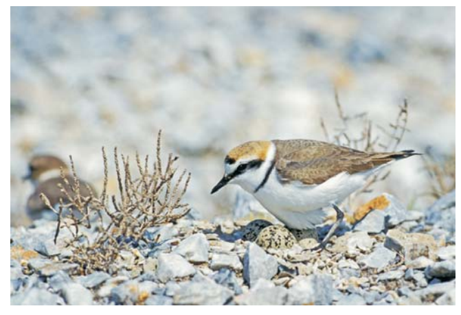
Figure 9 Shorebirds like the Kentish Plover ( Charadrius alexandrinus ) often lay their eggs directly in scrapes on pebblecovered coastline. Like Snowy Plovers, Kentish Plovers may select nest habitats containing gravel stones resembling eggs in size and colour. Nesting near uninteresting egg-like objects may

Another intriguing-but so far unexplored-possibility is that eggs masquerade as more mundane natural objects in the surrounding habitat. Masquerade is different from crypsis per se in that it prevents recognition, rather than detection, by providing resemblance to inanimate and inedible objects (Stevens and Merilaita, 2009a). Western Snowy Plovers (Charadrius alexandrinus nivosus) often select nest habitats characterised by gravel stones that resemble eggs in size (Colwell et al., 2011); nest survival increased with the number of egg-sized stones in the nest vicinity. Colwell et al. (2011) suggest that the presence of egg-sized stones may enhance background matching. This may indeed be the case, but we propose that these stones may confer additional protection if predators fail to recognise real eggs amidst a backdrop of uninteresting egg-like objects. This raises the exciting possibility that some shorebirds may select their nest environments not only to reduce predator detection via background matching (as seen in Solís and de Lope, 1995; Blanco and Bertellotti, 2002; Mayer et al., 2009) but also to reduce predator recognition via masquerade (Figure 9). Future experiments could test this by varying the number of egg-like objects in the microhabitat and measuring subsequent breeding site preference and egg survival rate.