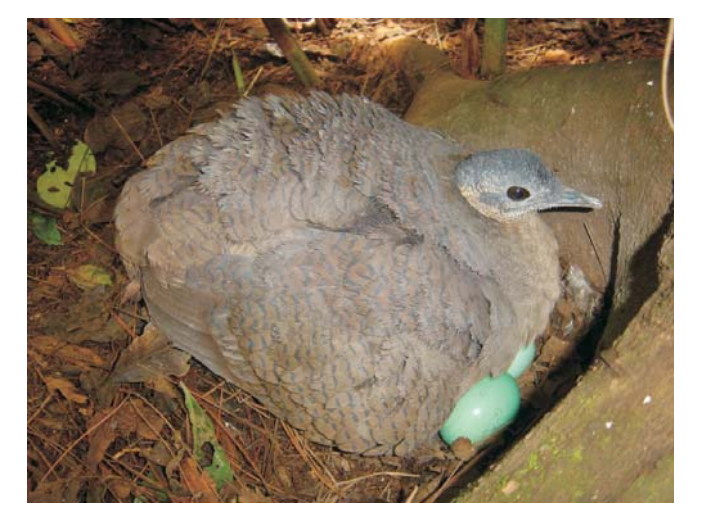
Figure 5 Selection for camouflaged eggs may be reduced if predators rely on different cues or have poor vision. Great Tinamou ( Tinamus major ) nests are primarily targeted by dichromatic mammals, which do not detect the eggs themselves but rely on behavioural cues from incubating parents to locate nests. The brightly coloured eggs may be an intraspecific signal to other Tinamou females to promote communal egg-laying.

Tinamou (Tinamus major) eggs (Figure 5), which are vibrantly coloured in glossy shades of turquoise. Brennan (2010) determined that mammalian predators pose the greatest threat to Tinamou eggs, yet these predators do not detect the eggs themselves when locating nests but rely on behavioural cues from incubating parents. The bright egg colours (Figure 5) might be irrelevant to mammals but important to conspecifics, perhaps as a signal to other females to promote communal egg-laying (Brennan, 2010). Predator-specific visual models could be used to determine the degree to which Tinamou eggs are conspicuous to avian females but cryptic to mammals, raising the intriguing possibility of a 'deer hunter' effect in egg colouration. The blaze orange vests worn by deer hunters are purposely conspicuous to trichromatic humans but camouflaged to dichromatic deer and other large game (Von Besser and Gutting, 2011). The opposing influences of conspecific and predator vision on animal colouration have been well documented in many taxonomic groups including fish (Endler, 1991), birds (Håstad et al., 2005) and reptiles (Stuart-Fox et al., 2003; Macedonia et al., 2009), but whether similar concepts apply to egg camouflage remains to be seen.