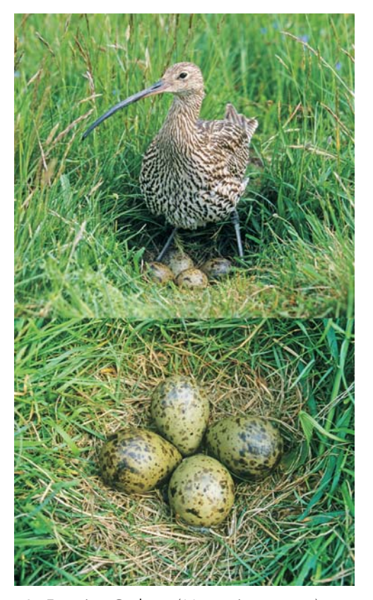
Figure 2 In Eurasian Curlews ( Numenius arquata ), camouflage may function at many different levels. Both the adult's plumage (above) and eggs (below) seem to be concealed in the tall grasses of the breeding grounds. Adults are often aggressive toward predators, offering an additional line of protection.

and pattern diversity (Kilner, 2006) yet at the species or genus level, experimental work does not uniformly demonstrate that egg appearance serves to protect eggs from predators (Underwood and Sealy, 2002; Kilner, 2006; Cherry and Gosler, 2010).