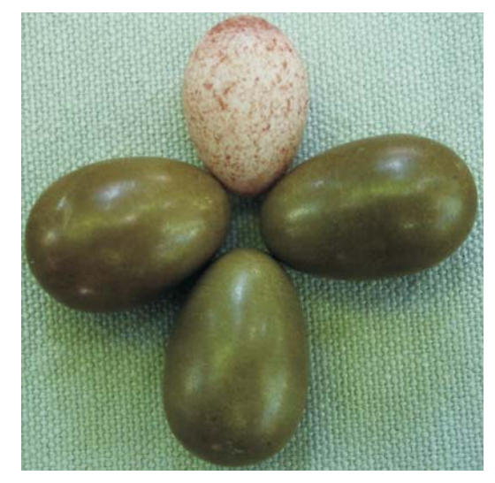
Figure 4 Brood parasitic Little Bronze-cuckoos ( Chalcites min utillus ) lay dark, cryptic eggs in dark host nests, which could reduce detection and removal by the host or a second female

Just as hosts affect the parasite's egg colouration, so parasites, in turn, can influence the colour of the host's clutch and this too can lead to eggs that are less than optimally camouflaged. Hosts can escape mimicry by brood parasites if individuals diversify their clutches, with each host female effectively laying her own distinctive egg type so that she can more readily spot any foreign egg within her clutch. The Tawny-flanked Prinia ( Prinia subflava ) dramatically illustrates the process in action: to escape egg