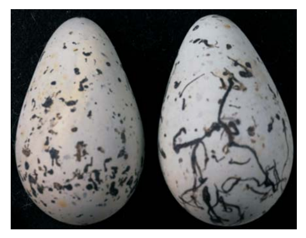
Figure 8 The distinctive markings on eggs laid by the Common Murre ( Uria aalge ) might serve as an identity signal to help parents discriminate their own eggs from those of neighbours, or they might disrupt the outline of the egg and help prevent detection by predators. These functions are not mutually

Disruptive colouration occurs when highly contrasting shapes or markings on the edge of the